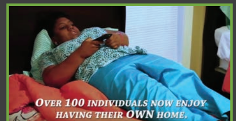
OVER 100 INDIVIDUALS NOW ENJOY HAVING THEIR OWN HOME.

Thank you for your assistance in helping improve the lives of the individuals we have transitioned into the community. Your generosity has helped over 100 individuals with disabilities gain more independence, a life in the community and a place they can call HOME!