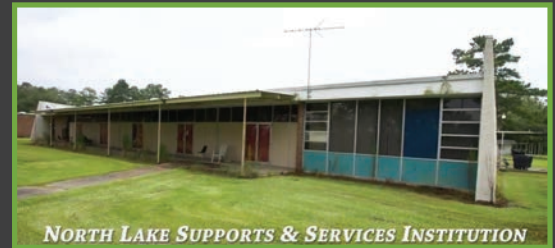
NORTH LAKE SUPPORTS & SERVICES INSTITUTION

Evergreen Life Services is committed to quality care and services for individuals with intellectual and developmental disabilities. In October 2012, Evergreen assumed the operations of the previously state-run institution for individuals with disabilities in Hammond, LA. Evergreen believes the care and support for individuals with disabilities is best done in the community and began crafting a plan to make the transition a reality.