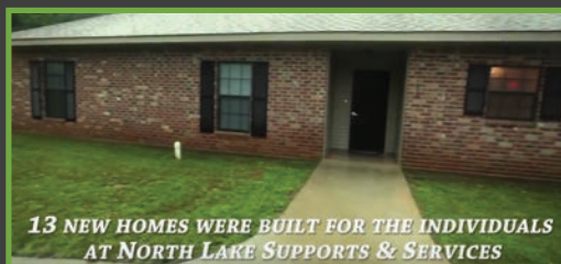
13 NEW HOMES WERE BUILT FOR THE INDIVIDUALS AT NORTH LAKE SUPPORTS & SERVICES