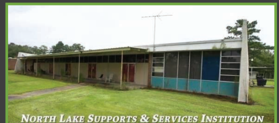
NORTH LAKE SUPPORTS & SERVICES INSTITUTION

As we close the North Lake Institution, our financial situation will improve. We will no longer have to pay expenses to operate both the institution and the homes simultaneously. For example, the expense for electricity at the institution is approximately $70,000 per month. With the elimination of this expense, coupled with many others, our budget will stabilize.