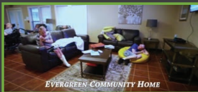
EVERGREEN COMMUNITY HOME

During the 2015-2016 fiscal year, significant progress was made toward this endeavor. Evergreen built and renovated 13 homes for individuals at the North Lake Institution. Six to eight individuals will reside in each home.