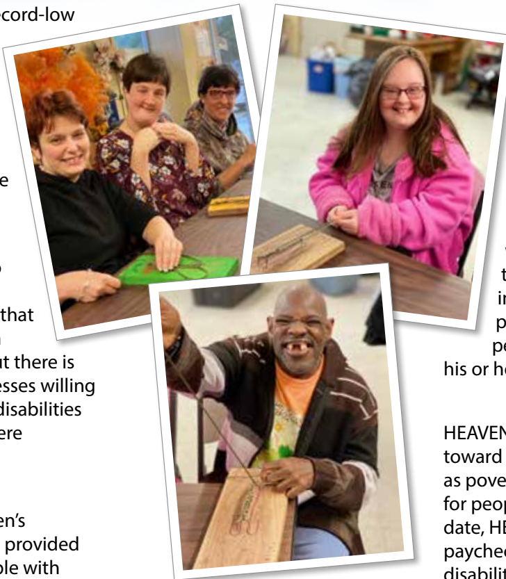
Above: Individuals served by Evergreen earn paychecks for their work creating HEAVENDROpt products.

When parachutes are retired from the U.S. military they are often destroyed. HEAVENDROpt acquires them before they are destroyed. We then repurpose them into products, allowing us to provide paychecks to the people we serve as well as veterans with disabilities.