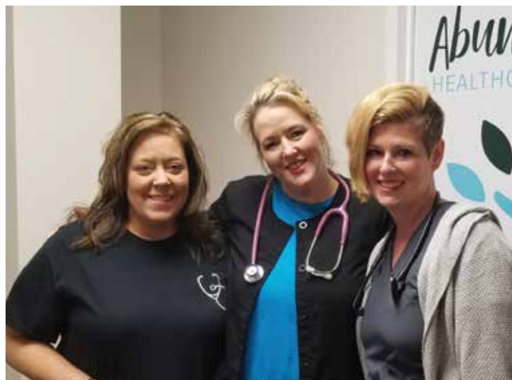
Above: Abundant Healthcare Clinic's providers all have training and experience in treating individuals with intellectual and developmental disabilities.

Today, the clinic is staffed with a physician and nurses who are trained in providing healthcare for individuals with disabilities, specifically with I/DD. Since its inception, there have been nearly 400 patient appointments.