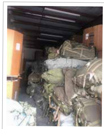
Left: Piled near the ceiling, our Florida facility is home to one of the largest private supplies of U.S. military parachutes in the world.

To shop our HEAVENDROpt products, visit heavendropt.org .