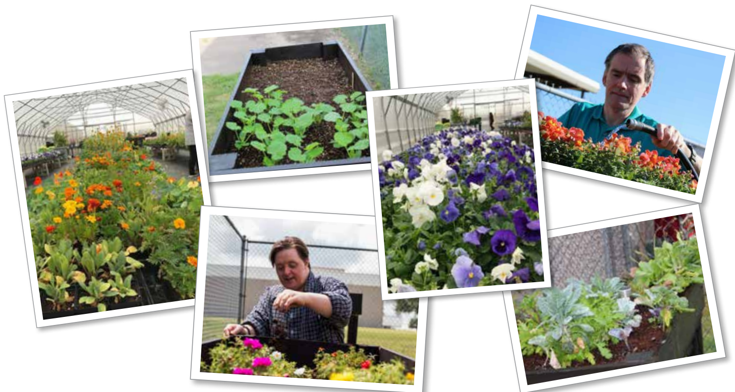
Above: More images from Evergreen's Dallas Day Program's Greenhouse